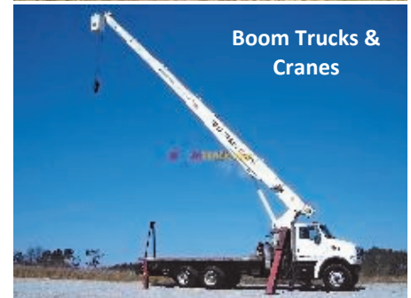
Boom Trucks & Cranes