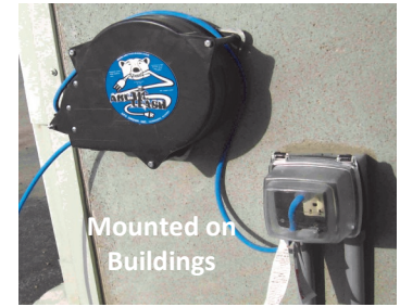
Mounted on Buildings