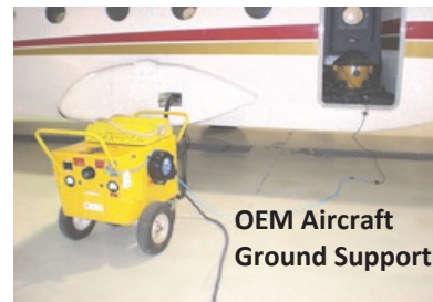
OEM Aircraft Ground Support